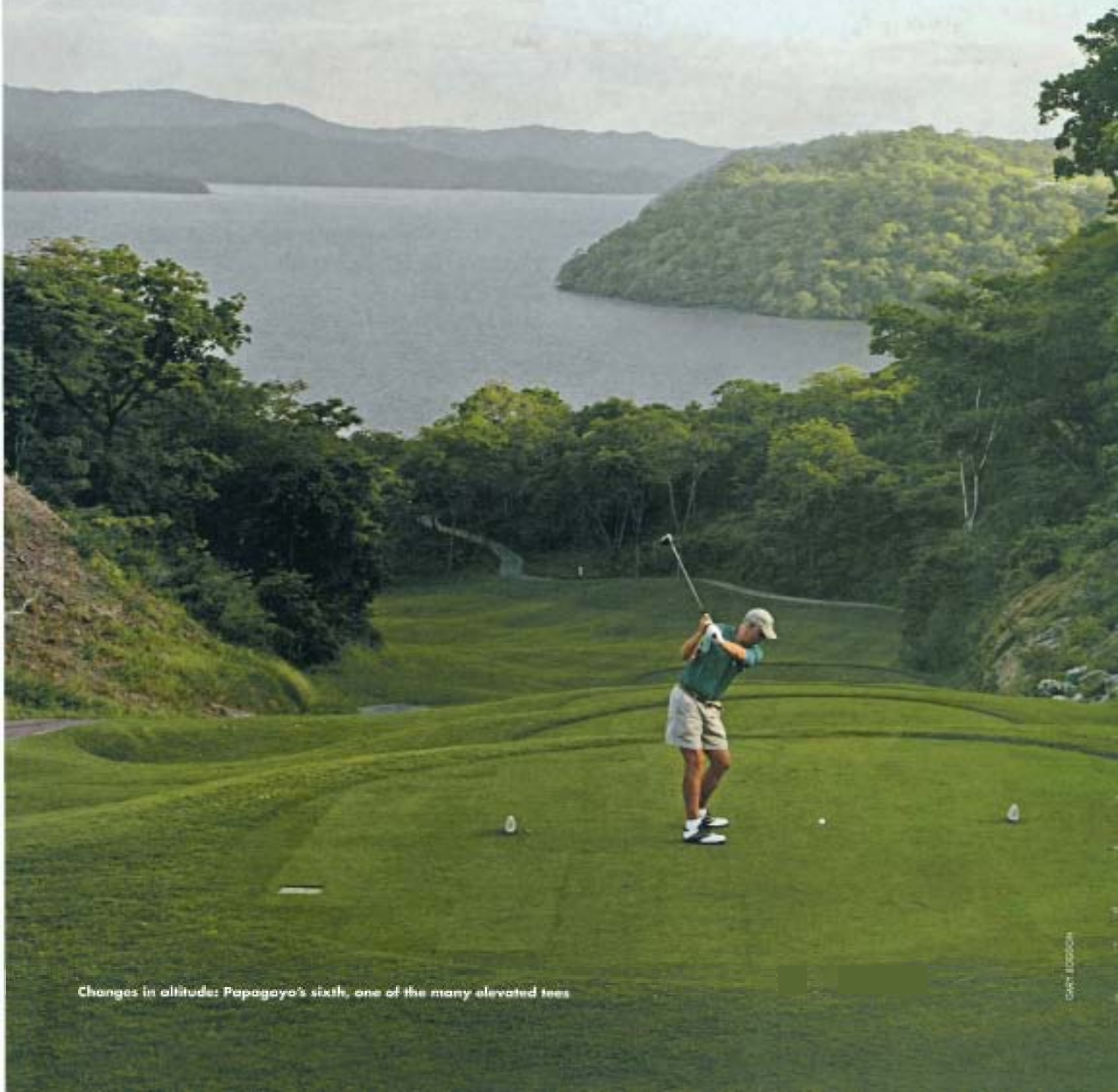
Changes in altitude: Papagayo's sixth, one of the many elevated tees

COURSES, RESORTS, DESTINATIONS AND DEALS